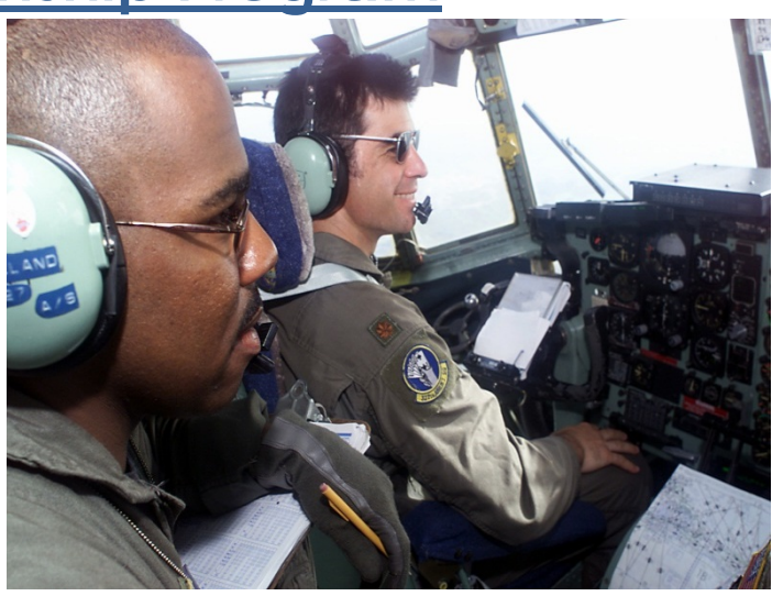
Who We Hire